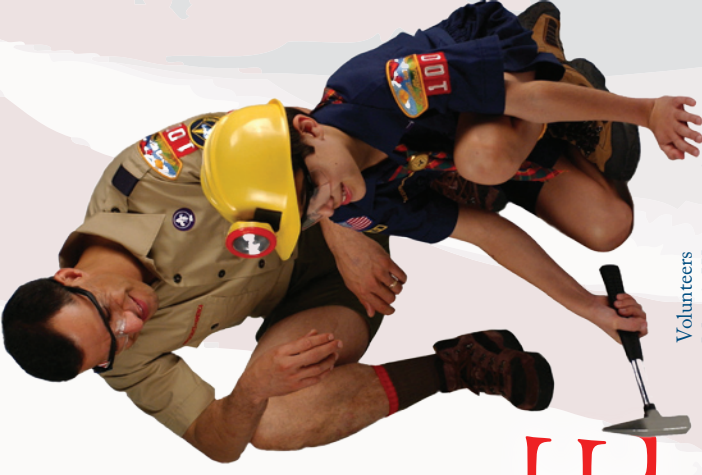
Volunteers Men & Women 18 & up Hombres y Mujeres de 18 años ó más