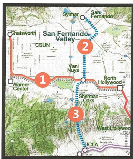
Map courtesy of MoveLA

These projects must be prioritized in future ballot measures, federal funding requests, and the identification of other funding resources by the Los Angeles Metropolitan Transportation Authority in order to maintain the Valley's support.