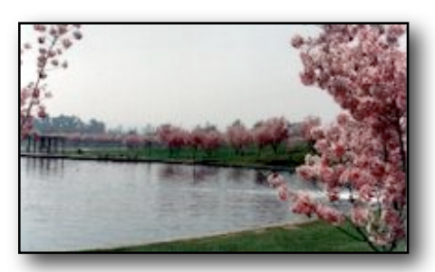
IT REALLY IS CALLED LAKE BALBOA